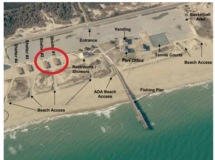
LITTLE ISLAND PARK